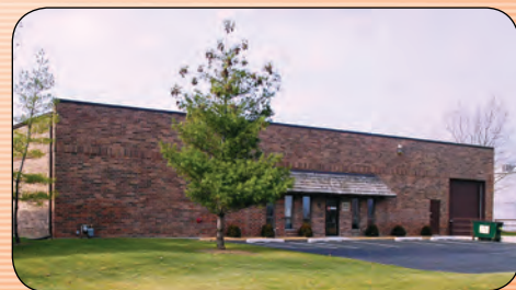
Orland Park, Illinois